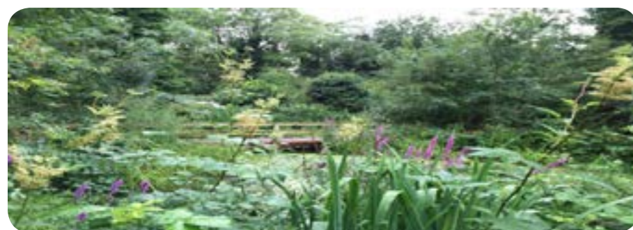
Pond at Eden-Rose Coppice / Sudbury